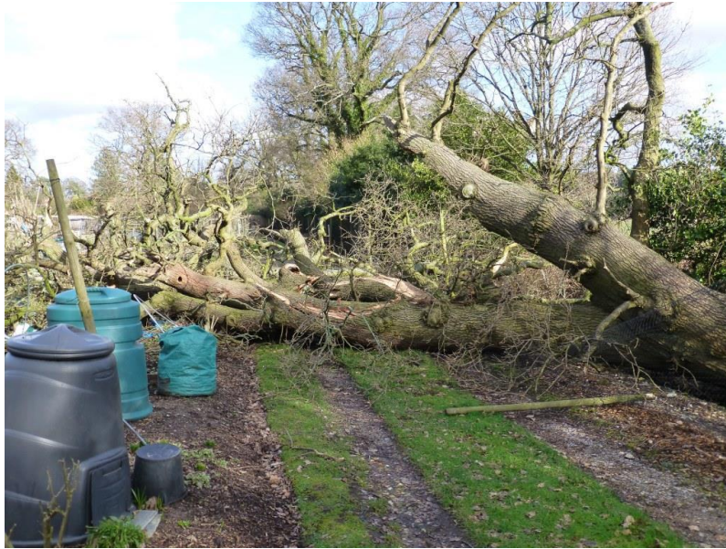
Oak tree blown down in 2014

More recent work on the site has included: dealing with an oak tree which came down in a storm in February 2014, damaging one plot and the deer netting; plus the installation of a further water standpipe on the western side of the site in May 2014.