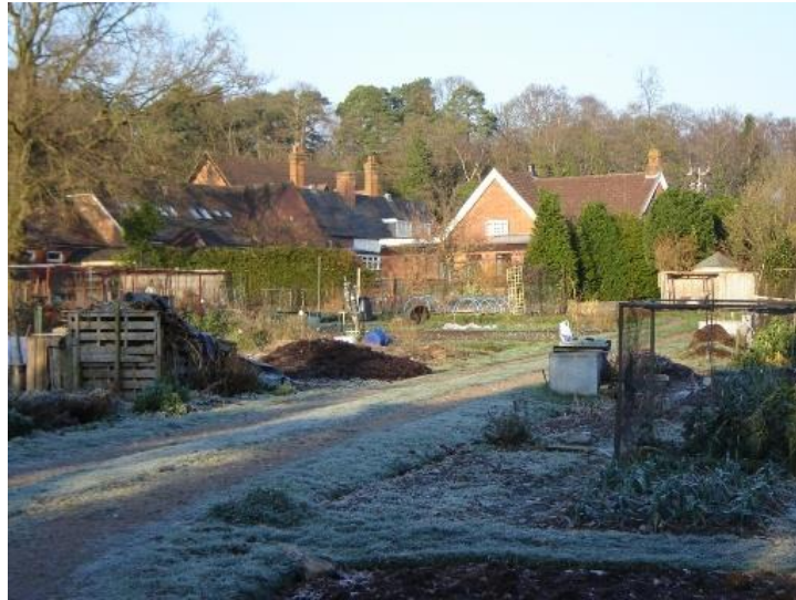
Sunningdale Village Hall, viewed from the south end of the allotments.