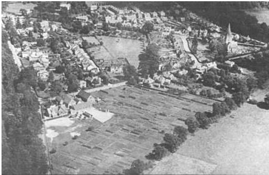
Aerial photograph of allotment site and surrounding area (taken in 1932)

Discussions over the following months led to an agreement that the Parish Council would lease the allotment field plus "an area of rough meadow adjoining Wardour Lodge" (the current site of the Parish Council office and the Broomhall Recreation Ground). The total size of the allotment site was in excess of 7 acres for which the Parish Council agreed to pay an annual rent of £2 5s per acre. The lease was eventually signed by the Council on 14 th January, 1896 and legally came into effect in February. The idea of having a recreation ground was meanwhile put on hold.