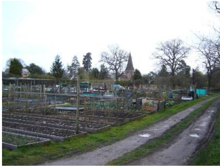
Bottom of the main path, looking east

1990 and early 1991 saw a period of investment by the Parish Council, as a number of major improvements were made to the site under the stewardship of councillor Norman Davis. They included: the installation of gates; the creation of a car park area; new water tanks and taps; the making of “roads” on the site to allow access to vehicles, and the clearing of the ditch.