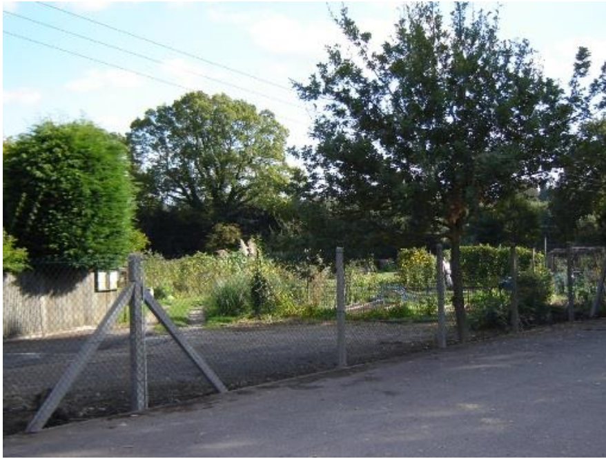
New fence between allotment car park and Village Hall car park (installed in 2008)

During 2008 an anonymous donation of £4,000 was received to cover agreed improvements and maintenance work.