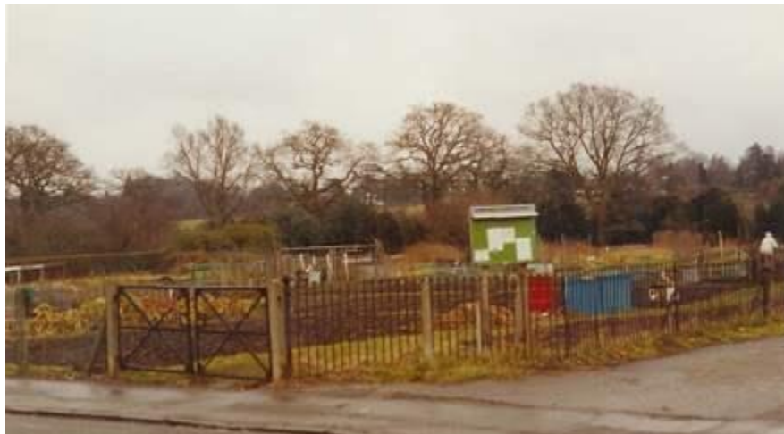
Entrance to allotments prior to the housing development on Church Road

1985 commenced with a decision to increase the plot holders' rent to £1.40 per pole (95p for OAPs) after St. John's College increased the Parish Council's rent. More importantly, it was followed almost immediately by the return of fears for the future of the allotment site when an application was made by the College's agents and a developer to build 29 4-bedroom houses on the site. The possibility of an alternative allotment site (the boggy field behind the CMI building again) was mentioned by the agents but rejected by the Parish Council.