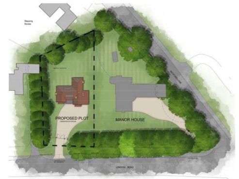
Fig.9 – Proposed Site Plan (not to scale)

The Land Adjacent to Manor House (the land is part of the current garden as shown to the right) is located within the Green Belt, adding to the levels of compliance required to meet the strict standards for building a new dwelling.