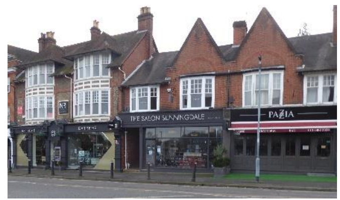
London Road – opposite Waitrose and the Station Car Park

A number of these comparable fast – food outlets as well as other shop frontages are shown below.