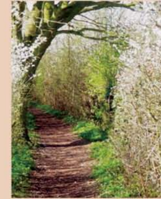
Hedgerows in blossom

From the Jubilee Clock on the A30 go east for 1/4 mile to the footpath sign. Turn left crossing fields and bounded by hedgerows to Bedford Lane. Turn left and at the crossroads go straight ahead to High Street with Holy Trinity Church on the left and the Baptist Church on the right. Pass the Nags Head (a welcoming atmosphere with a core menu of British pub classics) and continue to a junction.