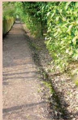
The Cinder Path

Bear left through the woods, the path narrows and after a stream turn left then right at the corner of the golf course. The path bears left through the woods to Shrubbs Hill Lane.